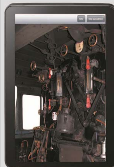
Steam Loco Cab Pictured