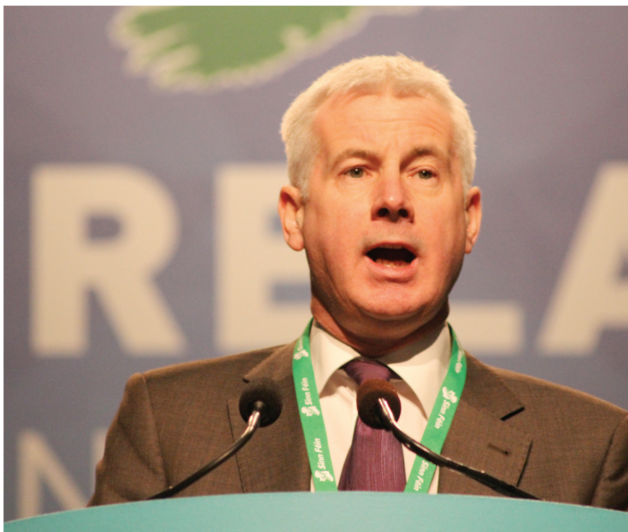
Sinn Féin spokesperson of Foreign Affairs, Seán Crowe TD