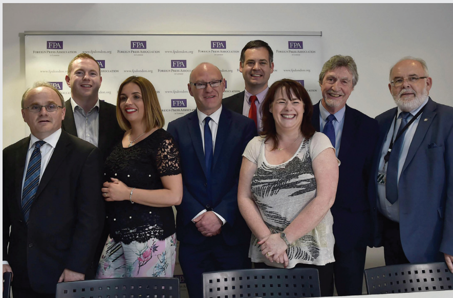
Back: South Down MP Chris Hazzard, Donegal TD Pearse Doherty. Front: West Tyrone MP Barry McElduff, Foyle MP Elisha McCallion, West Belfast MP Paul Maskey, Fermanagh South Tyrone MP Michelle Gildernew, Newry Armagh MP Mickey Brady and Mid Ulster MP Francie Molloy.

The final engagement of the visit was a public meeting in the London Irish Centre in Camden. With just two days' notice