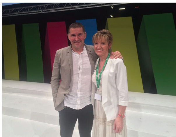
Arnaldo Otegi and Martina Anderson MEP at the EH Bildu conference in Bilbao.

dependent alternative. Building a strong party, based in the community, the people and social movements, is an important step towards fighting for freedom and justice. This is even more important in places like the Basque Country and Ireland, where we are both still struggling for national liberation as well as social justice. I told the delegates that they can always rely on Sinn Féin to be a constant ally and friend to the Basque struggle and the Basque people. I hope that in the time ahead EH Bildu can seize the opportunity to represent and unite all the Basque people in a peaceful struggle for liberation, independence and social justice'.