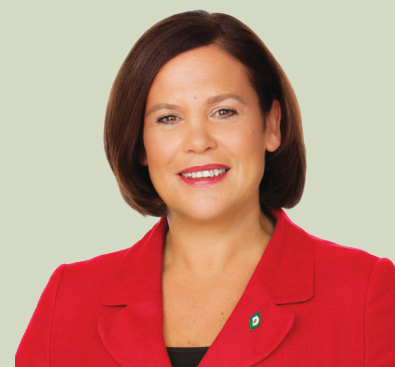
Sinn Féin Deputy Leader Mary Lou McDonald TD

"Sinn Féin will continue to support the rights of Palestinian prisoners and the legitimate demand of their people to nationhood and freedom based on the 1967 borders with East Jerusalem as its capital."