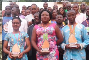
Awards: Best Poster and Best oral Presentations