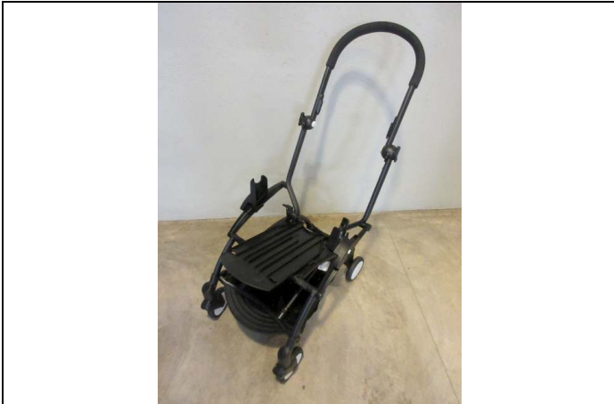
Configuration of the adapters and backrest during the test