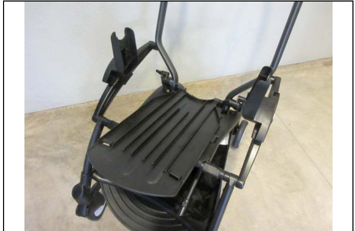
Detail of the configuration of the adapters and backrest during the test