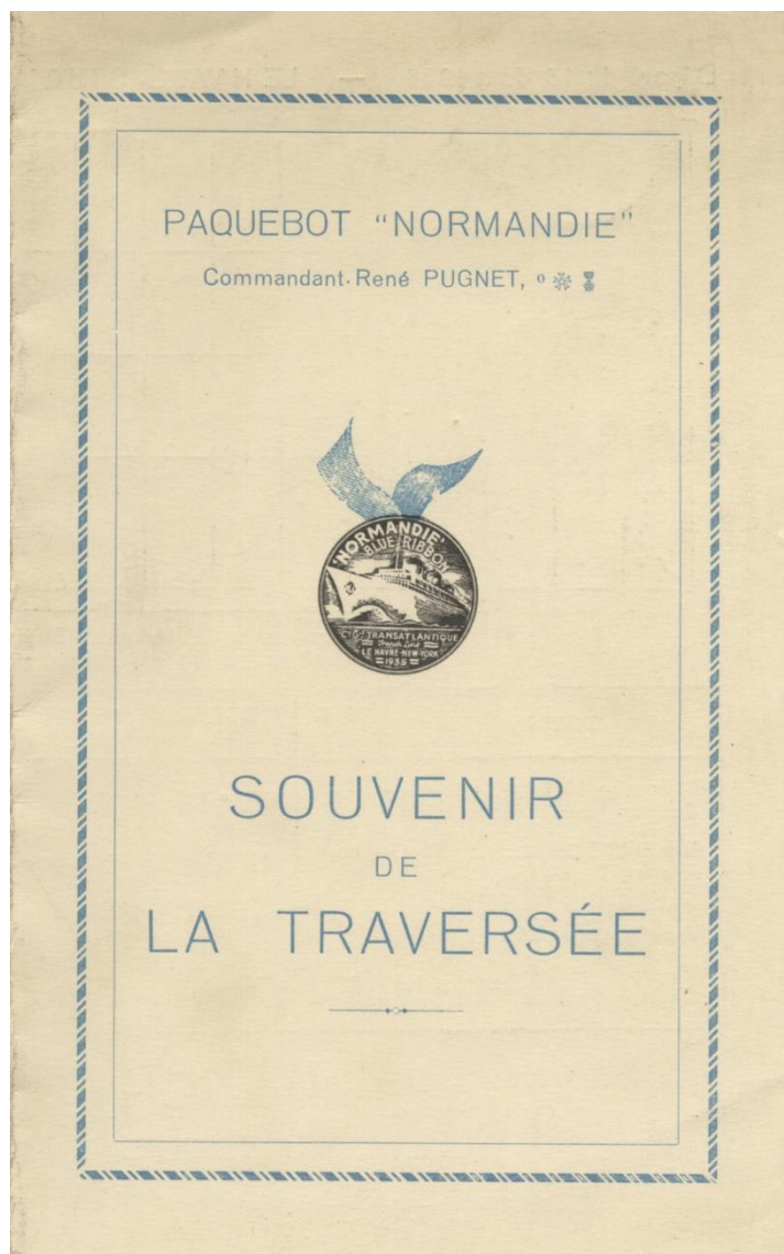
Couverture / Cover