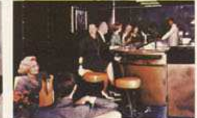
After the sun hides and the evening spreads its romantic cloak the FRANCE begins to breathe music, parties, dining and laughter. Sparkling shows, moonlit dances, midnight buffets all verily set the sea aglow...