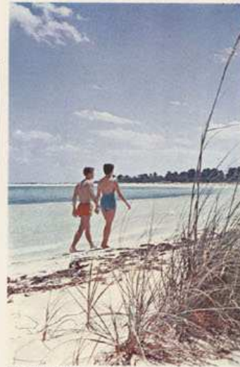
MILES OF BEACHING BEACHES