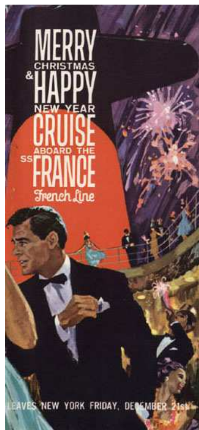
Couverture du dépliant