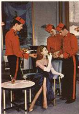
Any French Line office or any of the company's authorized travel agents will be glad to furnish you with full particulars and to arrange reservations in your favor.