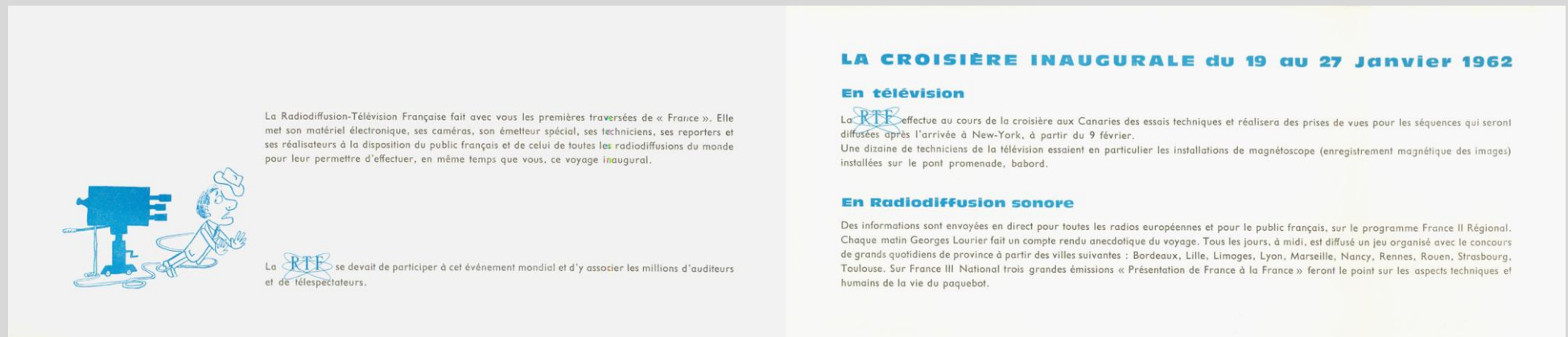
Intérieur gauche de la plaquette