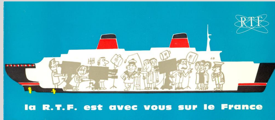
Couverture de la plaquette