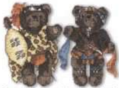
South Africa - Themba + Mball