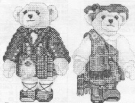
BLANE & BONNIE

***** YOU MAY MAKE ONE COPY OF THIS CHART FOR YOUR PERSONAL USE AS A STITCHING AID *****