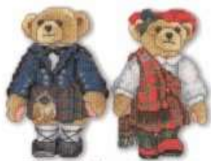
Scotland - Biane + Bonnie