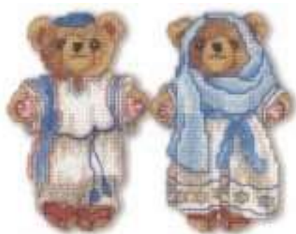
Israel - Gilad + Arietta