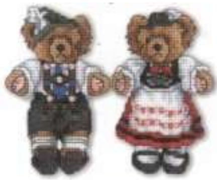
Germany - Gottfried + Gerda