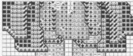
Detail of Henry's Coat Hem without Gold backstitch and Fr.Knots

Notes: a few bear names don't have motifs due to the length of the names.