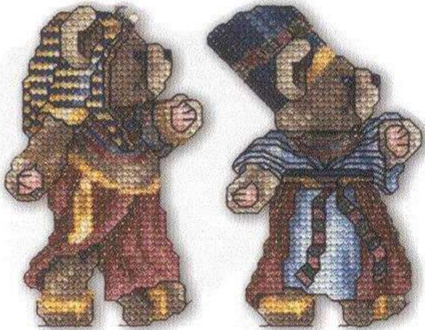
Egypt - Tutankhamon & Nefertiti