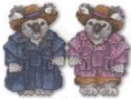
Australia - Sydney + Chloe