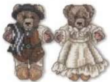
Argentina - Benicio + Belinda