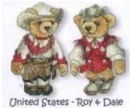
United States - Roy + Dale