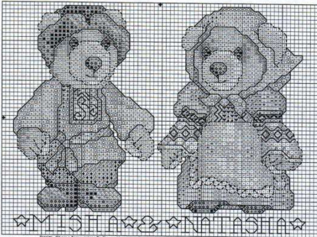
Design: Chart 4 Instructions by Donna Versillion Grampe, ©1998,2002 Donna Versillion Grampe, The Versillion Stitchery