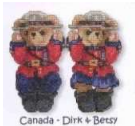
Canada - Dirk + Betsy