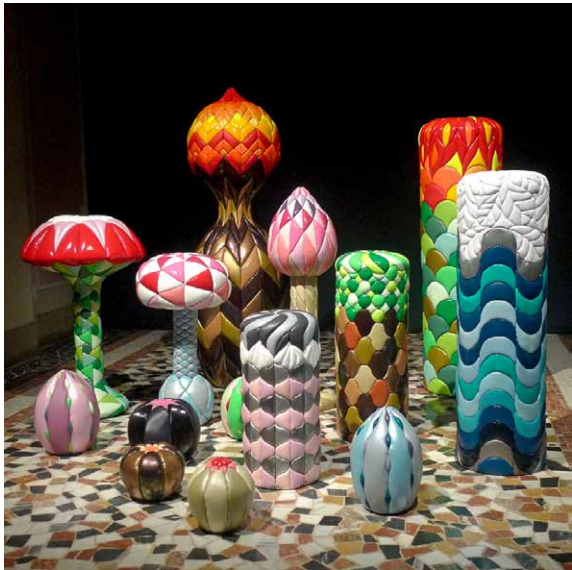
Mai Tabakian: Garden sweet garden, 2013 (installation view) textiles on extruded polystyrene, dimensions variable