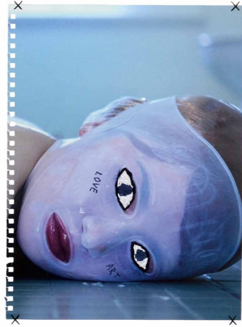
Françoise de la Tour: Untitled , 2015, oil on canvas, 90 x 130 cm