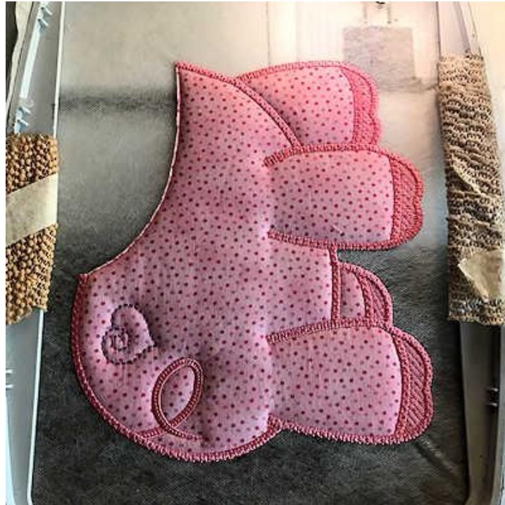
Section One Completed

Remove Design from Hoop Cut away excess stabiliser from the satin stitch edges Carefully cut as close as possible to the 'raw' edge that will be joined in the next section