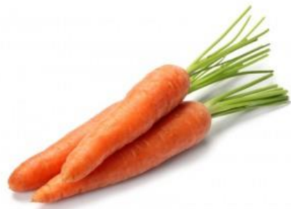
CAROTTE carotte - carotte