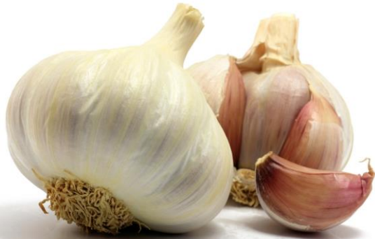
AIL ail - ail