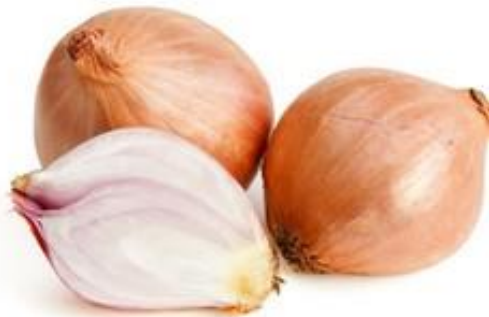
ECHALOTE échalote - échalote