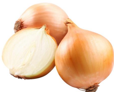
OIGNON oignon - oignon