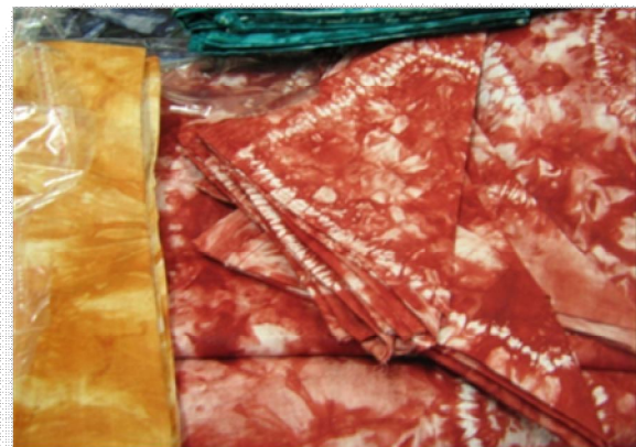
The finish Product of the Tie-dyeing session!