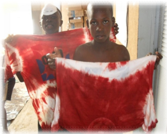
Boys proudly displaying their work!

On Thursdays after 'Action Rue', the team meets to evaluate the activities of the week, then plans the programme for the following week.