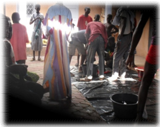
Tie-Dyeing Session in Nazareth!

The Literacy programme did already start last year, so that has continued this year and the number of students as increased! Some children have even asked to be taught English so the English Speaking animators have tried also to teach English to the children. The new addition to our Wednesday's activities has been the salon de hair-dressing! The children have asked for that so there is an Animator who cut hair in Nazareth! Thus our activities for Wednesdays are quite flexible and are numerous according to the needs of our children.