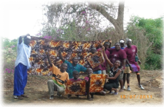
Children and Animators show off their work!