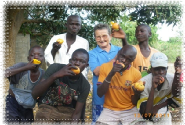
Breakfast time and eating mangoes at the Camp!

The month of August was the holiday month for Nazareth so we took sometime out for a break. When the activities started up again in September, we began with the follow ups of the children returned in and around Dakar and Thies area every Thursdays. We then moved to the Region of Kaolack and around the Saloum area. We had 5 animators go off to Kaolack on a Tuesday and using Kaolack as their base, went out each day to go check up on the children we had brought home from that area. They returned to Dakar on the Friday.