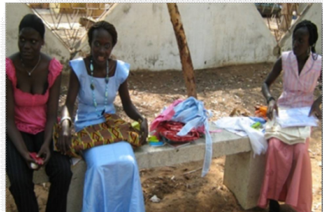
The girls during the Exposition at Hann Mariste!