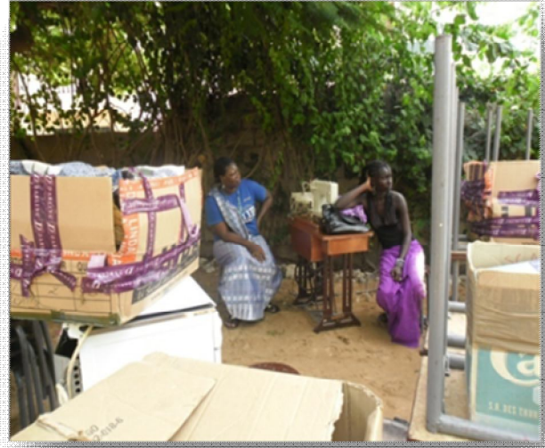
Friends helping to load furniture onto the truck while others wait with the rest!