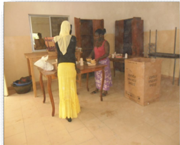
The girls and Monitrice organise the room at the new Church site at Hann!