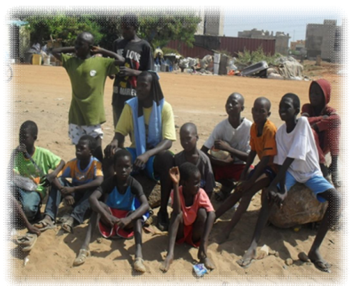
A Team prepares for the Foot ball Match while the others watch!