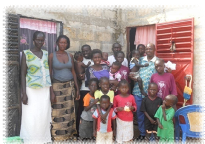
Follow up visits!