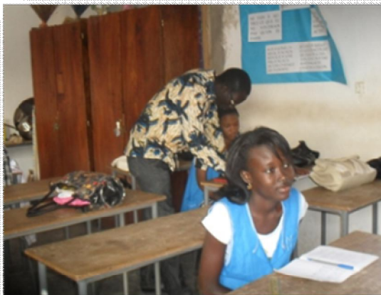
French course / Alphabetisation

In the last school year, 2010/2011, the Centre had 12 girls following the courses there. They were been taught by 5 Monitrice / Monitor. It hasn't been very easily financially to keep the Centre going but we've continued just the same with the bit of money we had. The Centre was helped very much also by the donation from the Dakar Women's Group who helped us buy materials for the tie-dyeing, sewing and embroidery activities. With the materials the girls were able to make things and sell those to help us out financially. Below then are some of the photos of our activities in Dalifort Centre.