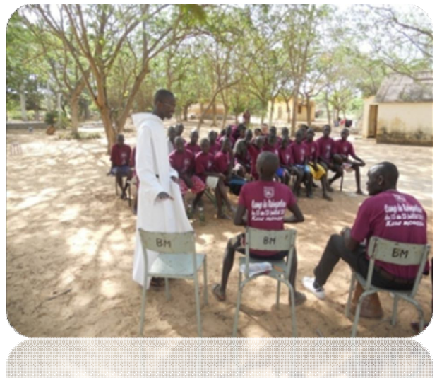
Boys put on a sketch while animators look on! Even a visit from a monk!