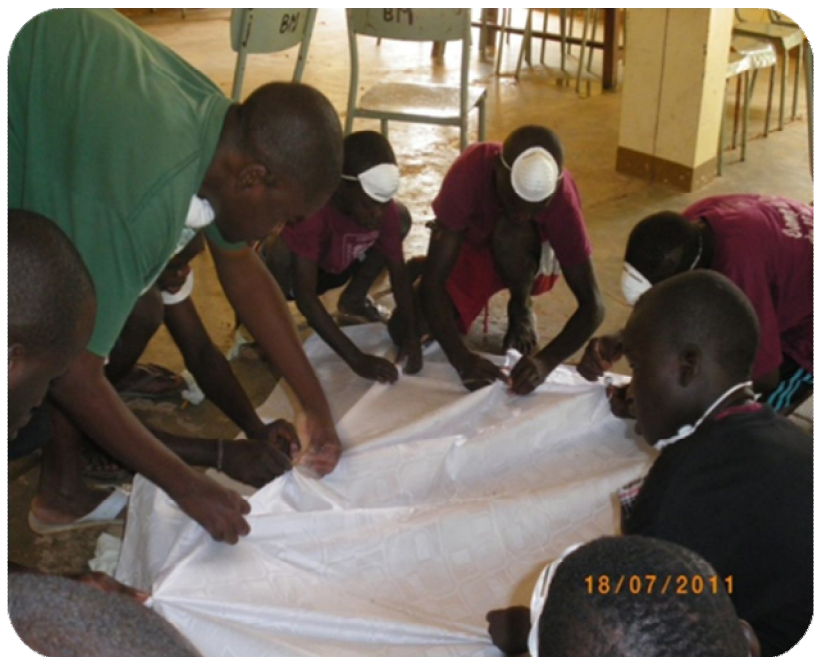
An Animator carries a sick child to the mobile clinic! A group prepares its cloth for Tie-dyeing!