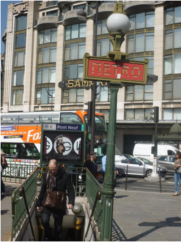
Exercices de repérage...