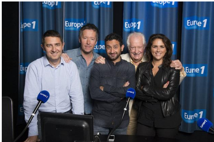
2 ème jour