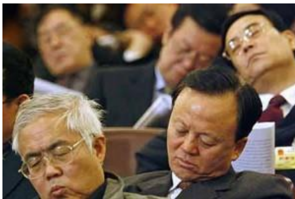
ICC's sleep ordinary conference

At the beginning of this year, the ICC decided to transform the 15th Congress of its section in France into an Extraordinary International Conference. The decision was motivated by the open outbreak of an organisational crisis immediately following its 14th International Congress in April 2001. This crisis has led to the departure from our organisation of several militants, who have recently regrouped in what they call the «Internal Fraction of the ICC». As we shall see, the Conference took note of the fact that these militants had deliberately set themselves outside the organisation, even if today they proclaim to whoever is prepared to listen that they have been «excluded».