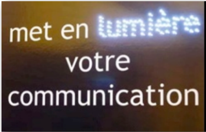
Highlights your communication