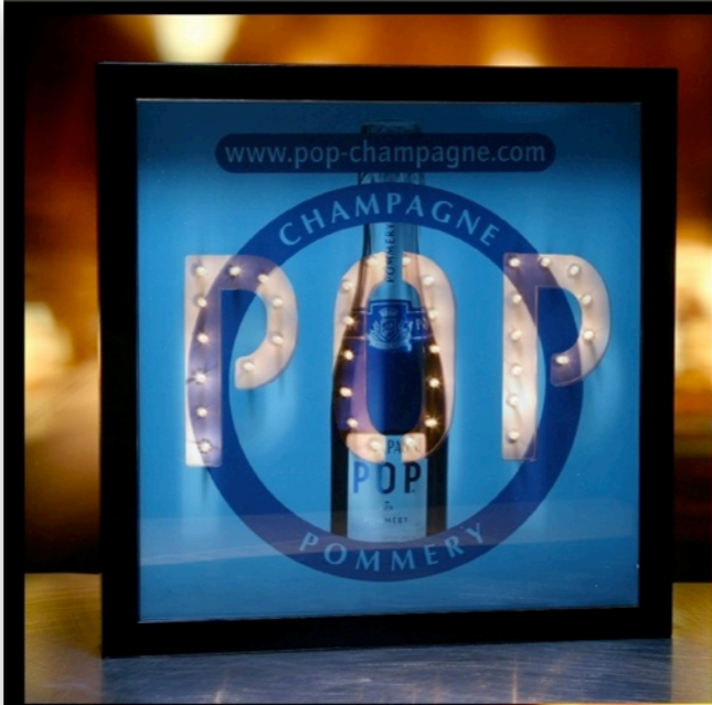
PLV - Spiritueux (France)