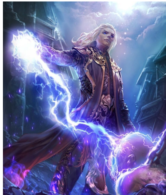
Art by kiyocat illust

The base starts at 8 and decreases by 1 per 5PP rounding to the nearest. Thus a magician with 10PP has a base of 6.