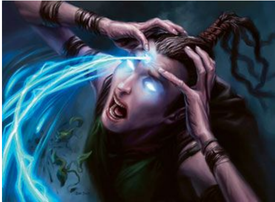
Art by Dan Scott

Powers gain an unpredictable side, sometimes good, sometimes bad. Specify which Arcana or abilities are concerned. These must be submitted to Dissonance. The effect depends on the Dissonance card sign.