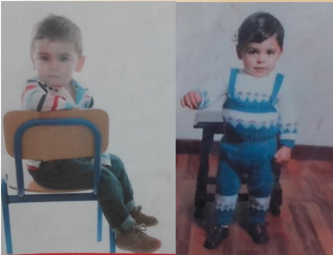
I'm like my dad!!! ... and I like it!!