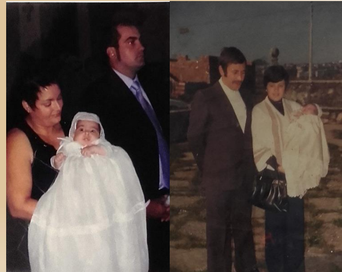
My grand-parents with my mother, my parents and me