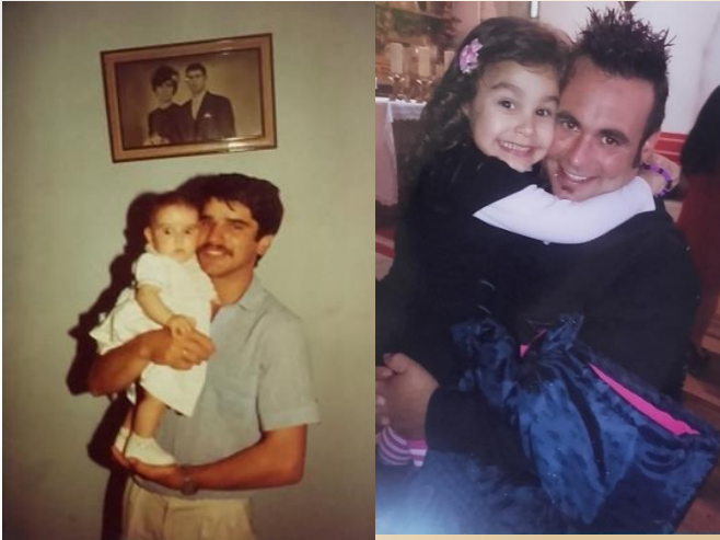
My grand-dad with my daddy, my dad and me