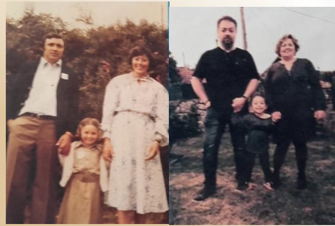
My grand-parents with my mother, my parents and me