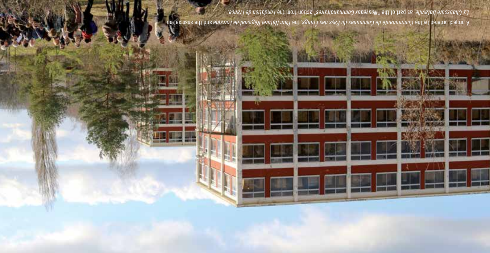
A project ordered by the Communauté de Communes du Pays des Étangs, the Parc Naturel Régional de Lorraine and the association La Chaussure Bataville, as part of the "Nouveaux Commanditaires" action from the Fondation de France.