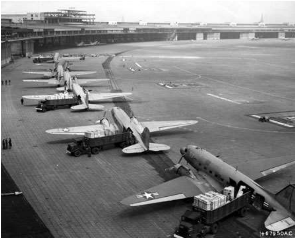
U.S. Navy and Air Force aircrafts unload at Tempelhof Airport during the Berlin Airlift.

How to Close the Gap?: American cartoon, 1948, by D.R. Fitzpatrick on the Russian attempt to drive the Western powers from Berlin by every possible means short of an outright act of war