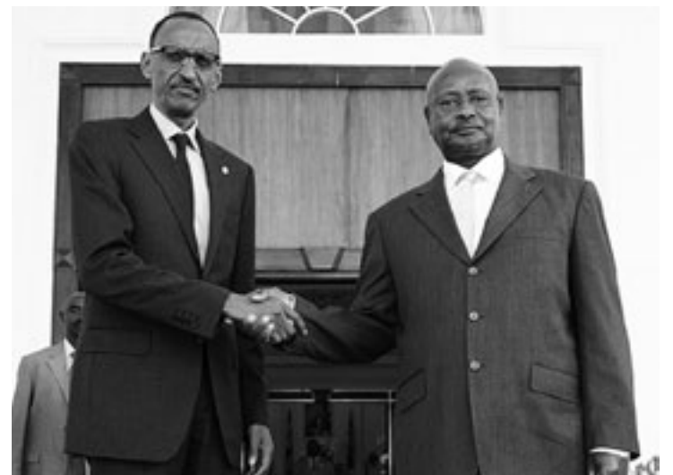
Perezida Kagame w'u Rwanda na Perezida Museveni wa Uganda.

Biraro avugaga ko komite ishinze umutungo wa Leta mu nteko ishingira amategeko (PAC) igomba gushyira imbaraga zose mu gucukumbura isoko y'imicungire mibi n'inyerezwa ry'umutungo, no kubifatira ingamba kugirango imisoro itangwa n'abaturage idakomeza kugendera ubusa.