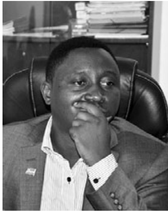
Green Party: Frank Habineza.

Nubwo Dr Vincent Biruta avuga ko ibyavuzwe na Mayor Ndamage batafata nk'aho ari iby'ishyaka RPF ariko byavuzwe n'umunyamuryango wayo kandi abitangariza imbaganyamwinshi