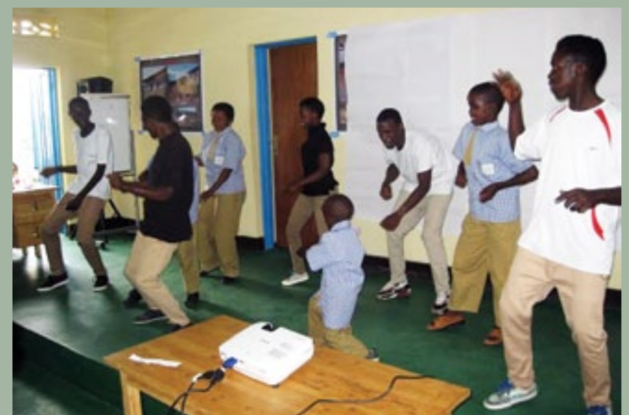
Umwana nkabandi Masho Crew.