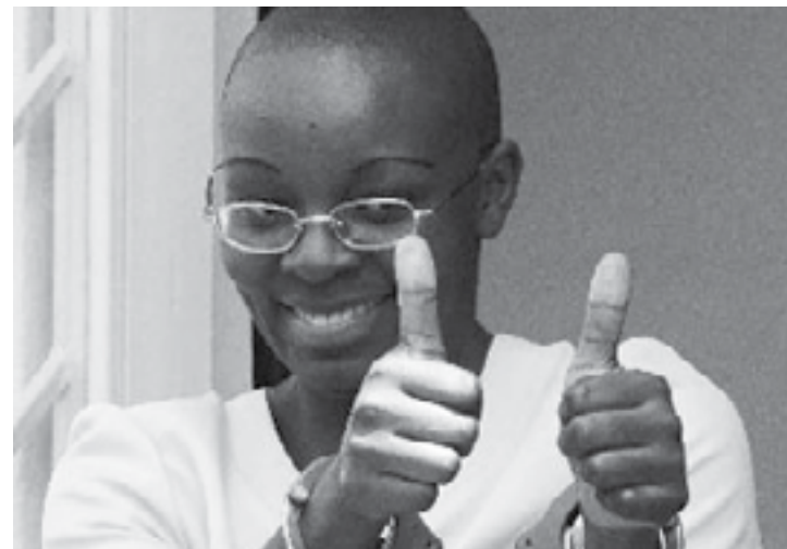
Victoire Ingabire Perezida wa FDU-Inkingi.