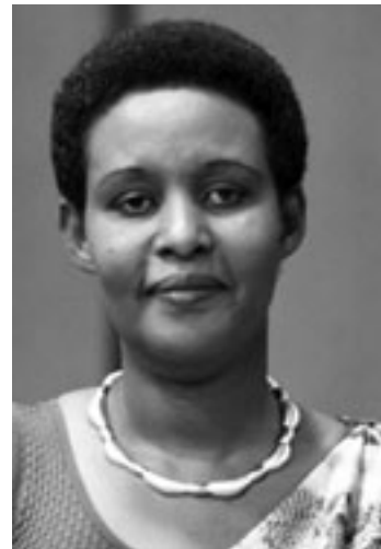
MIGEPROF: Minisitiri Oda Gasinzigwa

Kabutware avuga ko mu byagezweho, hashyizweho ibigo birwanya ihohoterwa nka Isange One stop centers, Polisi n'Ingabo nabo bakabishyiramo imbaraga ndetse na Haguruka ikaba hari imbaraga igenda ishikiranamo. Nubwo ariko asobanura ibi, anavugaga ko hari zimwe mu nzitizi zihari nko kuba abafatanyabikorwa bamwe batazi ibikubiye mu itangazo rya Kampala Declaration, kuba rimwe na