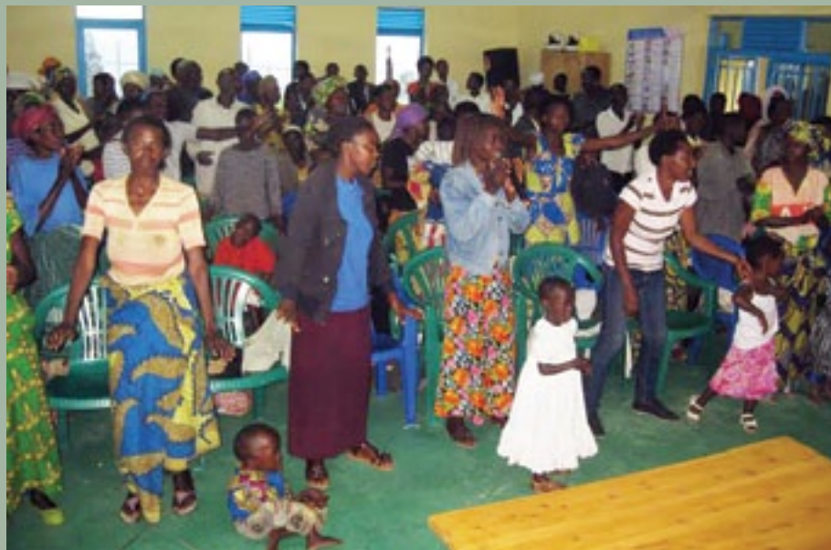
Ababyeyi bari bazanye abana babo kubasuzimisha.