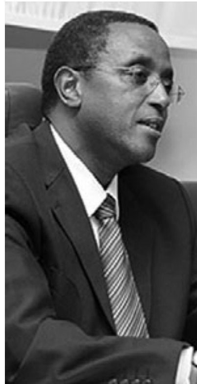
PSD: Dr. Vincent Biruta.