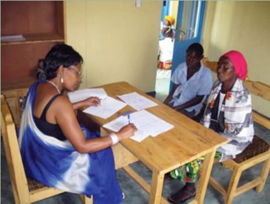
Ushinzwe imibereho myiza agira inama ababyeyi bafite abana babana n'ubumuga.