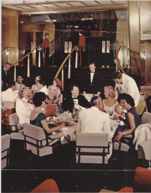
DELUXE GOURMET DINING