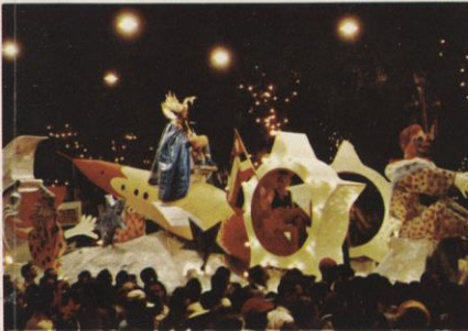
CARNIVAL IN RIO