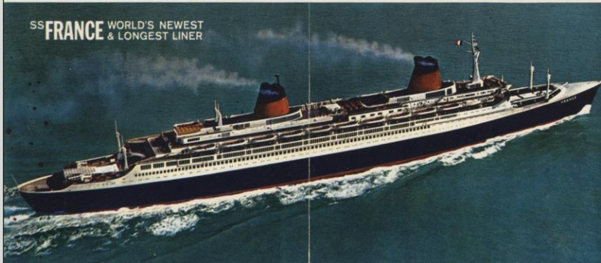
SS FRANCE WORLD'S NEWEST & LONGEST LINER

relax in the most carefree atmosphere in the world — play at whatever your heart desires — all luxuriously, pleasurably — on the superliner that thought of EVERYTHING! the unprecedented SS FRANCE