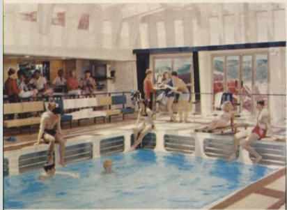
SUNLIT, GLASS-ENCLOSED POOL