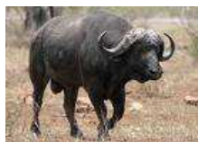
African b _____