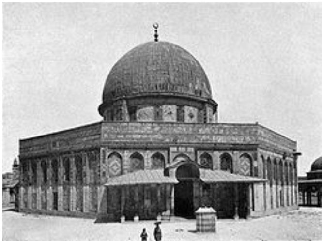
Muslim shrine, Dome of the Rock, on the Temple Mount in Jerusalem

worship on the very spot where both of the temples stood, one being the Temple of Solomon.