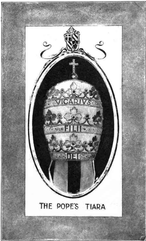
FROM A PHOTOGRAPH TAKEN IN THE VATICAN MUSEUM

As we add these sums together from each of the three words it makes exactly 666, which further establishes the "Roman Empire" as the beast, and also of this man.