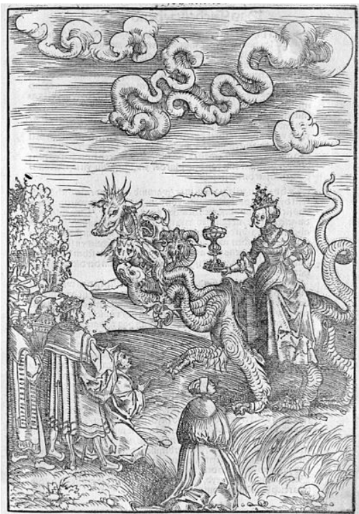
Whore of Babylon wearing a papal tiara from a woodcut in Luther's translation of the New Testament

This beast therefore is a symbol of the Roman Empire following the apostolic days, and down through this period to the end, when the beast and the rider go into perdition ( verses 8 and 16 ).