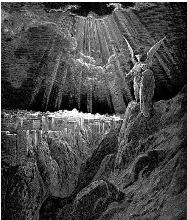
The New Jerusalem by Gustave Doré