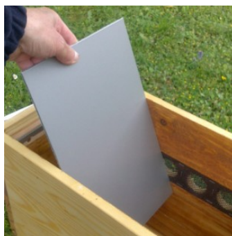
Poser flanc tbh (120°)