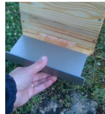
Condamner entrée Dadant