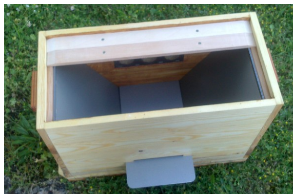
Poser barrettes tbh