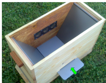
Insérer fond / planche envol tbh