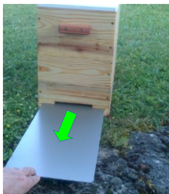
Enlever fond/Planche envol