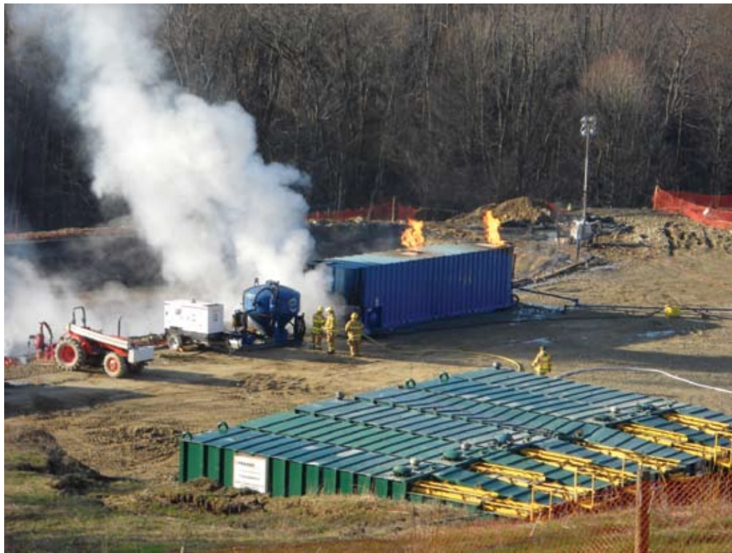
Volunteer firefighters respond to a fire in a wastewater pit at an Atlas Energy Resources well site in Washington County, Pa., in March 2010. Fracking places increased demands on emergency responders, creating new dangers that require additional training, and increasing demands for response to traffic accidents involving heavy trucks.

“A 2011 study of a Marcellus Shale well by researchers with the University of Pittsburgh estimated the cost of site reclamation (including reclamation of retention ponds and repairs to public roads) at $500,000 to $800,000 per well site.”